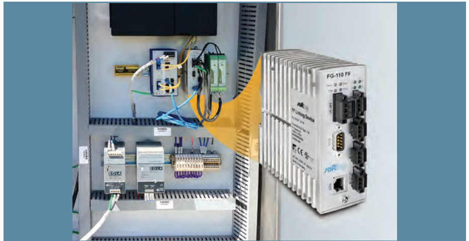
Figure 3: Remote cabinets located at the individual wells house the FG-110 FF gateway.

Issues identified during implementation and commissioning of the large-scale geothermal project have been successfully resolved. Up and running, the system proves how CiF advantages such as truly distributed control can offer a perfect solution for remote applications such as geothermal wells. As Tom McAuliffe, the POWER Engineers' responsible control system engineer sums up, "After researching the available options, Ram Power settled on the Softing FG-110 FF gateway product. POWER configured and installed the FG-110 FF products and commissioned them with the help of Softing's technical support. Softing's technical people were very responsive and helpful. POWER made several recommendations to Softing as to how the product could be enhanced and these modifications have been incorporated in the next firmware version. There are four Softing modules installed in the San Jacinto geothermal wellfield that have been working reliably for the last year. If Ram Power, or POWER Engineers, were to implement another FF Control in the Field project, we would definitely use the Softing gateway product line again."